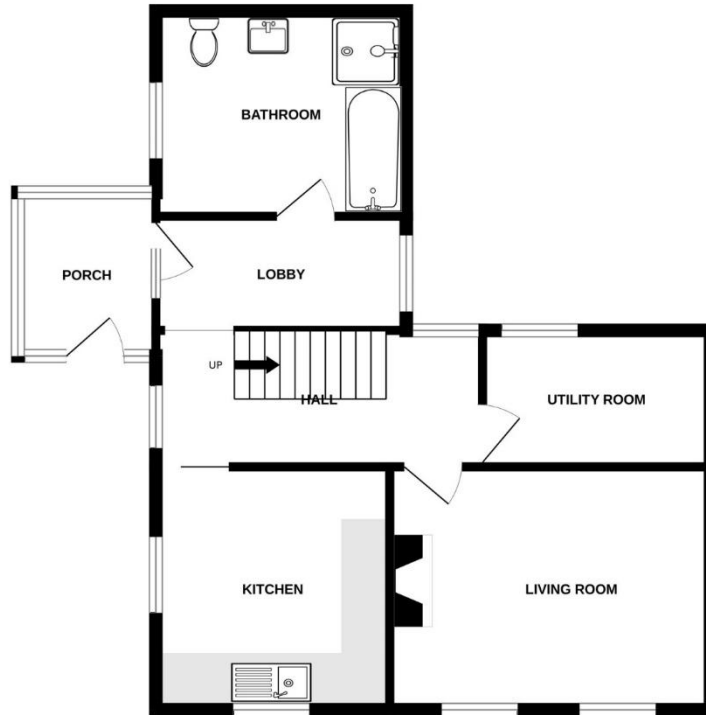
GROUND FLOOR 579 sq.ft. (53.8 sq.m.) approx.